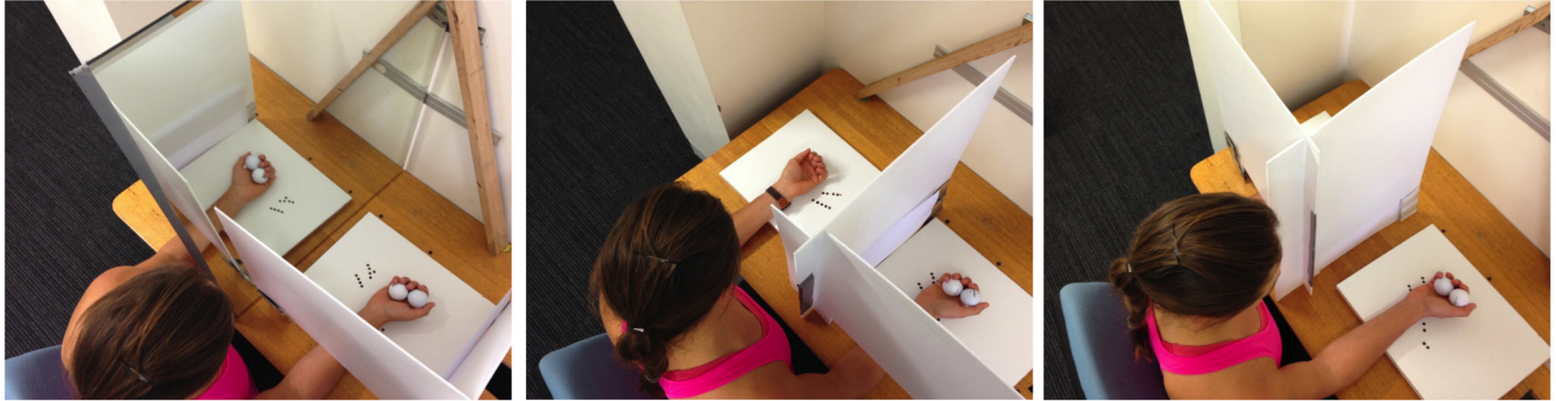
Fig 1. Experimental set up for the visual feedback conditions in the three training groups. Experimental set up for the visual feedback conditions in the three training groups: Mirror Vision (left), Passive Vision (middle), and Active Vision (right).