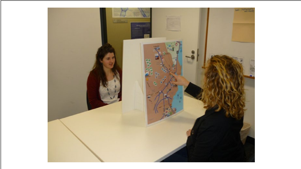
Figure 1. Experimental setup for map task.

the Caz, bikie, uggies ). The target words were selected from a database of frequently used Australian hypocoristics collected in 2009 (Kidd et al., 2011). These target words were illustrated by a picture on the map and included in two scripts consisting of four journeys each.